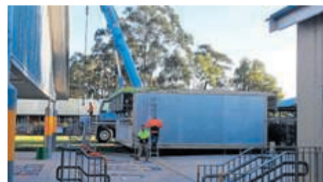
≡ Our unused demountable has finally gone!! More room for sports fields!!