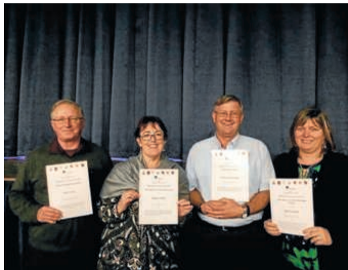
≡ Award Recipients