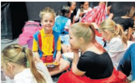
≡ Relaxing backstage before the show!