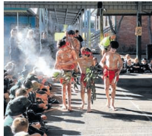
≡ Smoking ceremony

At Branxton Public School students, staff and community are Respectful, Responsible and achieve their Personal Best.