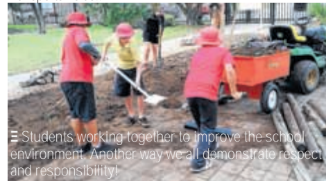
≡ Students working together to improve the school environment. Another way we all demonstrate respect and responsibility!