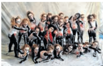
≡ Our delightful little monsters (aka the Senior Dance Team) warming up for their performance at the Hunter Region Dance Festival.