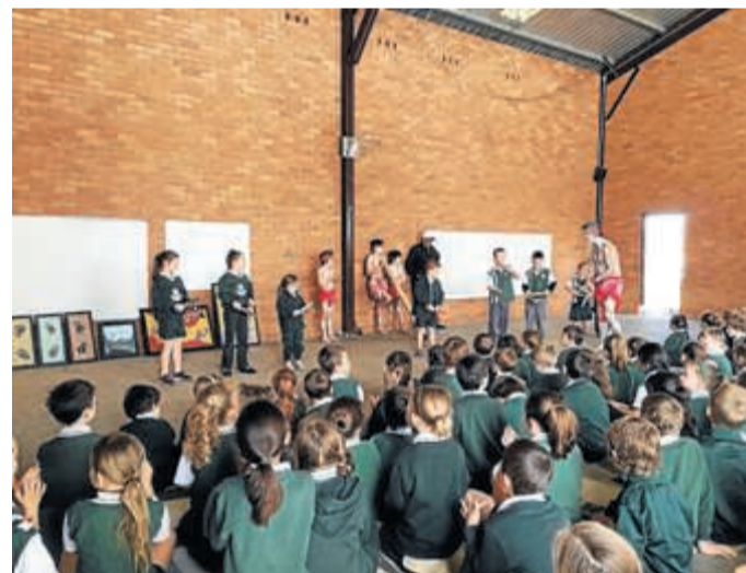
≡ Clapping sticks in action