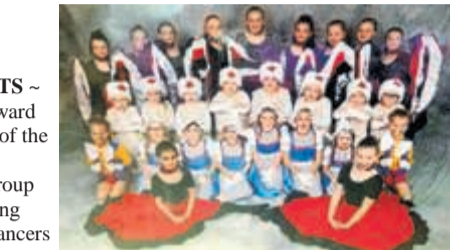
≡ The gorgeous Junior Dance Team before their performance at the Hunter Region Dance Festival.

At Greta Public School, we develop RESPECTFUL and RESPONSIBLE citizens who give their PERSONAL BEST .