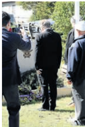
A minutes silence & a time to reflect